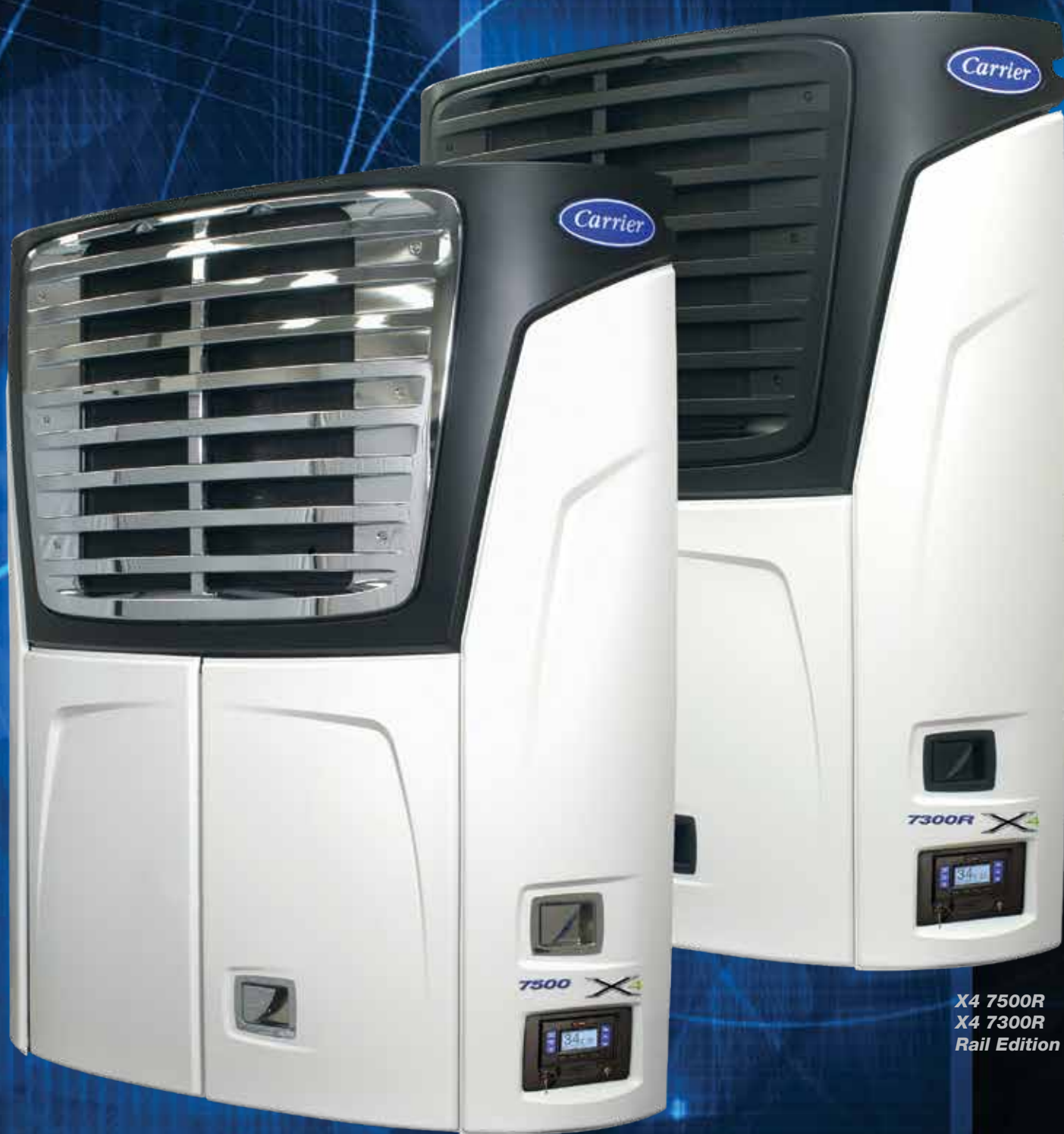
X4 7500 X4 7300