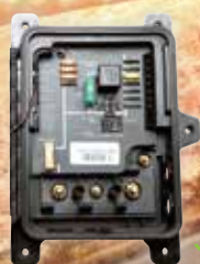
Power Control Module