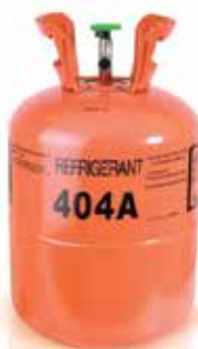
X 4 Series