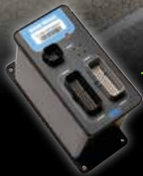
Main Micro Module